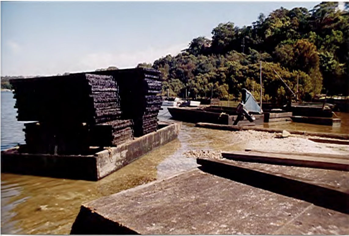
Barge loaded with Oyster trays, Neverfail Bay. 1999.