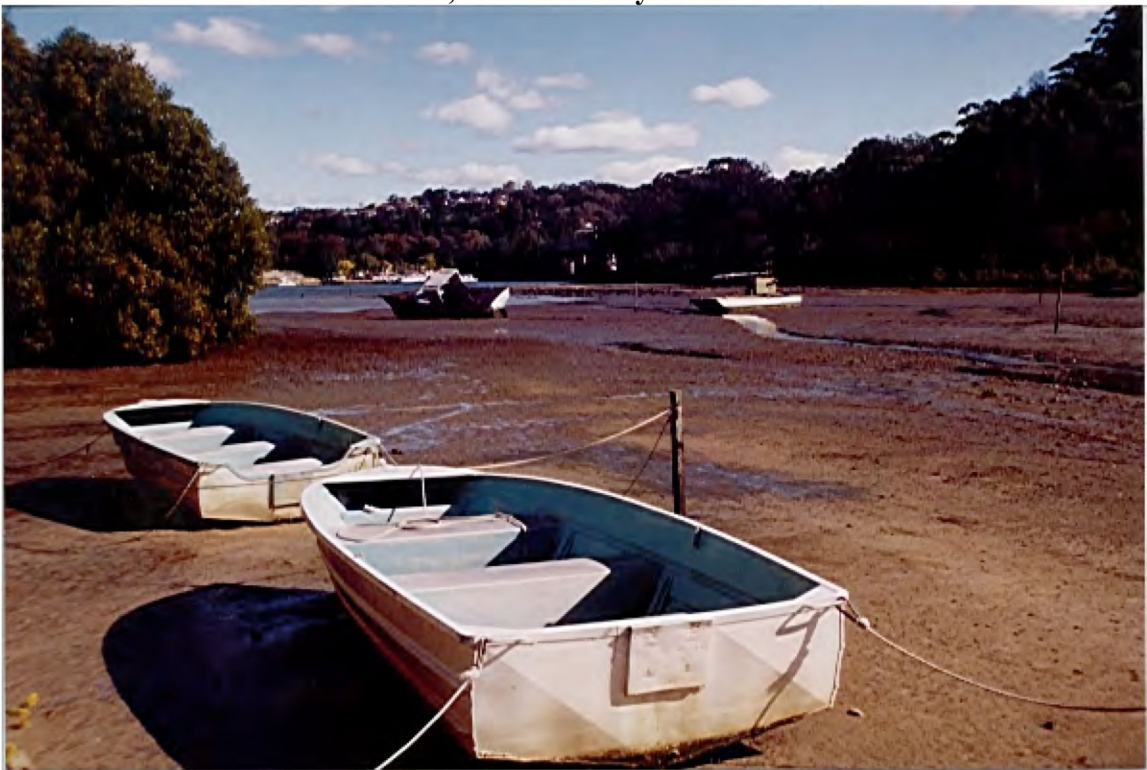
Low tide in Neverfail Bay, with "Kookaburra" laid up for a gearbox overhaul. Year 1999