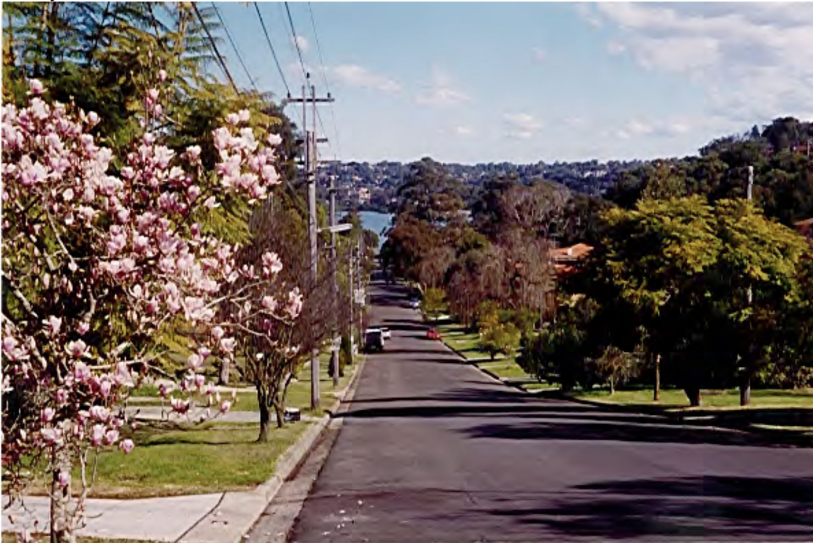
Wyong Street looking towards Neverfail Bay. 1999.

Neverfail Bay is situated at the end of Wyong Street, formally known as Cecil Street. The valley is nestled against the Illawarra railway line embankment and main pipeline from the Woronora Dam to the Penshurst Reservoir on the western side. On the eastern flank is a steep rise to Letitia, Algernon Streets and the general overall escarpment height of Oatley.