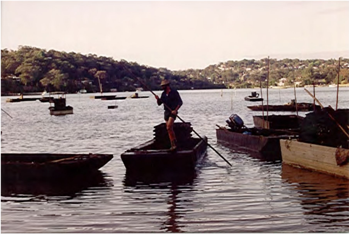
Ted Drake. Neverfail Bay 1992