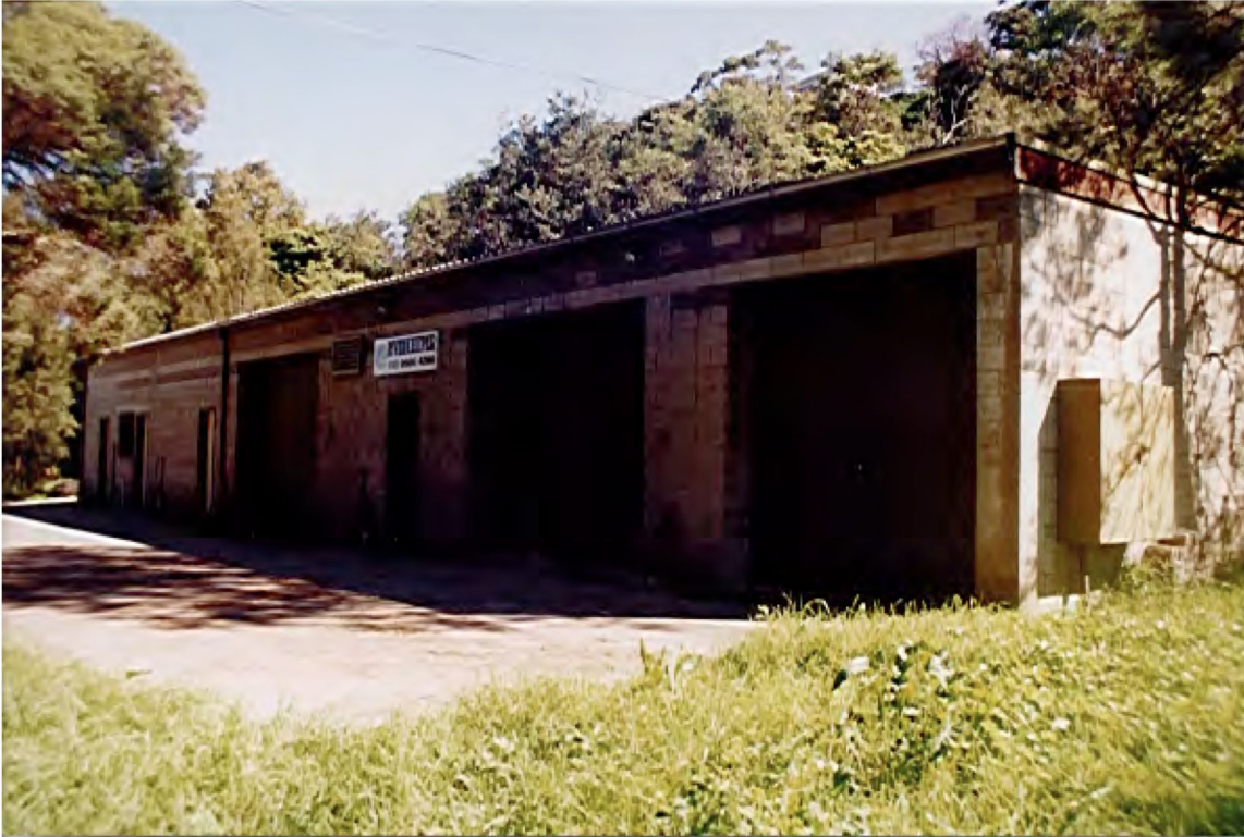
The Purification Shed nestled against the embankment near the pipeline.

Alas, another “Well” was drained with the development of the north western side of Wyong Street. The pool was skirted with blackberries and was opposite number 19 (James Derwent). The location would be difficult to find today.